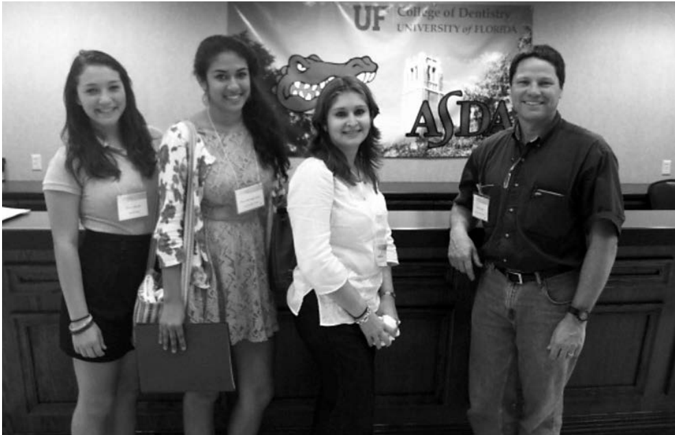
◀ Local high school students and teachers attended the conference