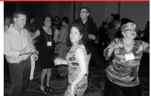
▲ Dancing the night away at the SECOLAS banquet.