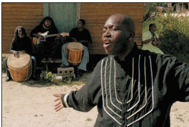
The Garifuna Institute would like to recognize the late Andy Palacio for his contribution to the preservation of the Garifuna language and culture. Palacio is known world-wide as the icon of Garifuna music.

UF and non-UF graduate students who are US citizens or permanent residents may apply for a FLAS fellowship to attend the Institute. The application deadline for UF's FLAS fellowships is March 2, 2009 . Details can be found at: http://www.latam.ufl.edu/Funding/ . Other universities may also have FLAS fellowships available.